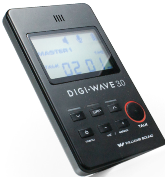
DLT 300 Transceiver