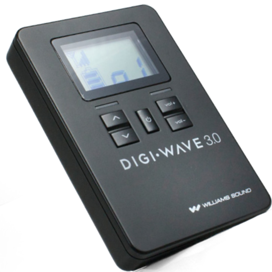
DLR 360 Receiver

The DLT 300 Transceiver features full-duplex capability, supporting up to four simultaneous talkers in two-way mode, and up to six simultaneous talkers in intercom mode. Slim, lightweight, and simple to set up and use. One- or two-way operation offers flexibility in an array of applications. With the push of a button, users can access two-way communication for immediate interaction or Q&A.