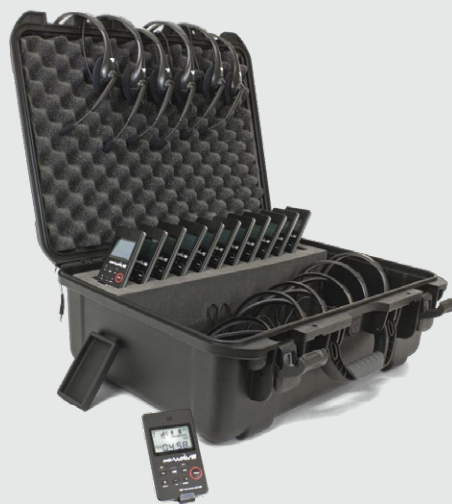
Digi-Wave™ DWS TGS VIP

equipment; frequently large tour groups; and technical information that often inspires interaction between guide and group. The Digi-Wave VIP relieves voice strain via its pure, clear, wireless audio; offers two-way capability for real-time group Q&A; and is completely portable, fitting in a customized carry case.